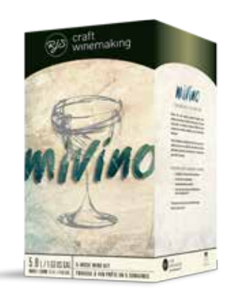
*bottles, corks, shrinks and labels sold separately

Make your next batch of craft wine Mivino – because your wine says a lot about you.